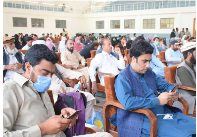
International disaster risk reduction day was observed at shaheed Benazir Bhutto University, Dir Upper