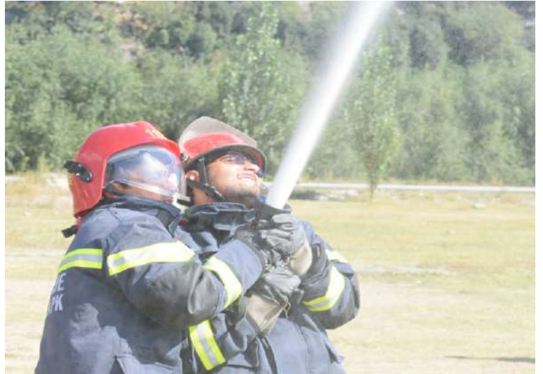
Mock drill exercise on International day for disaster risk reduction.