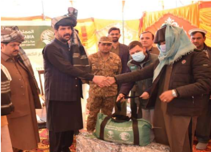
Minister for Relief Mr. Muhammad Iqbal Wazir distributed Relief items at Bakakhel Camp