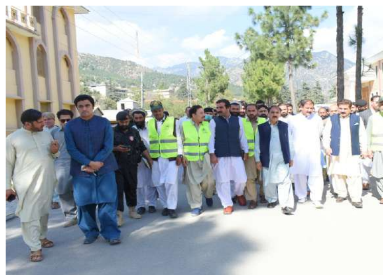
Disaster Awareness walk at Shaheed Benazir Bhutto University, Sheringal, Upper Dir on October 13, 2021