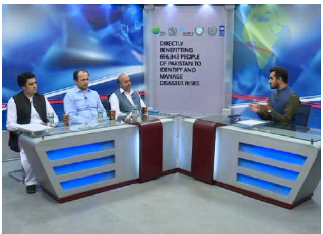
PDMA in collaboration with GLOF II organized a TV program regarding Climate change.