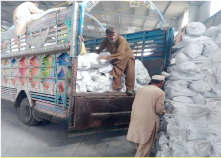
22 trucks of NFIs dispatched to District Administration North Waziristan.