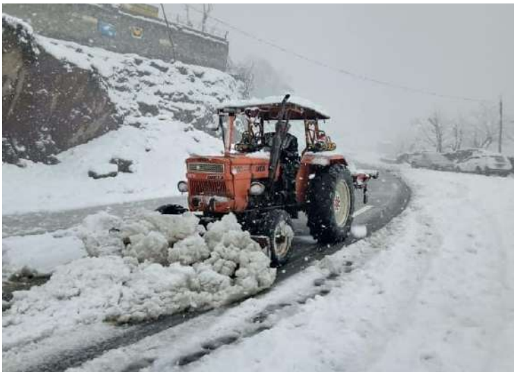
Road clearance operation after heavy snowfall at Malakand Division