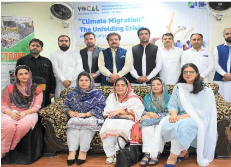
Group Photo of the participants of Workshop on "Climate Induced Migration in KP."